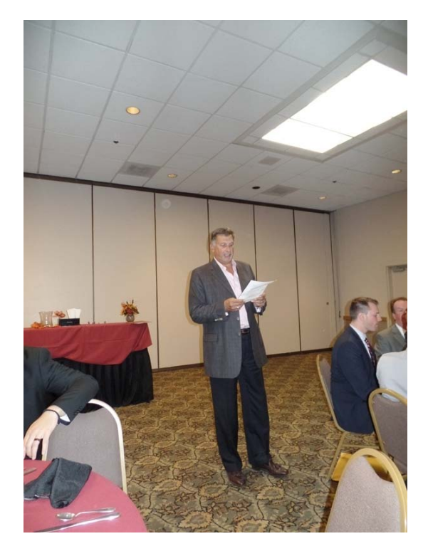
Installation of new Officers & Directors