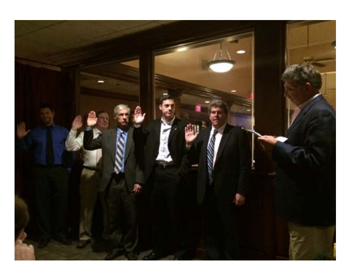
Installation of new Officers & Directors