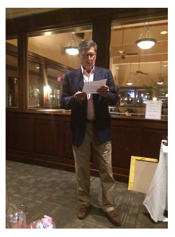
Installation of new Officers & Directors